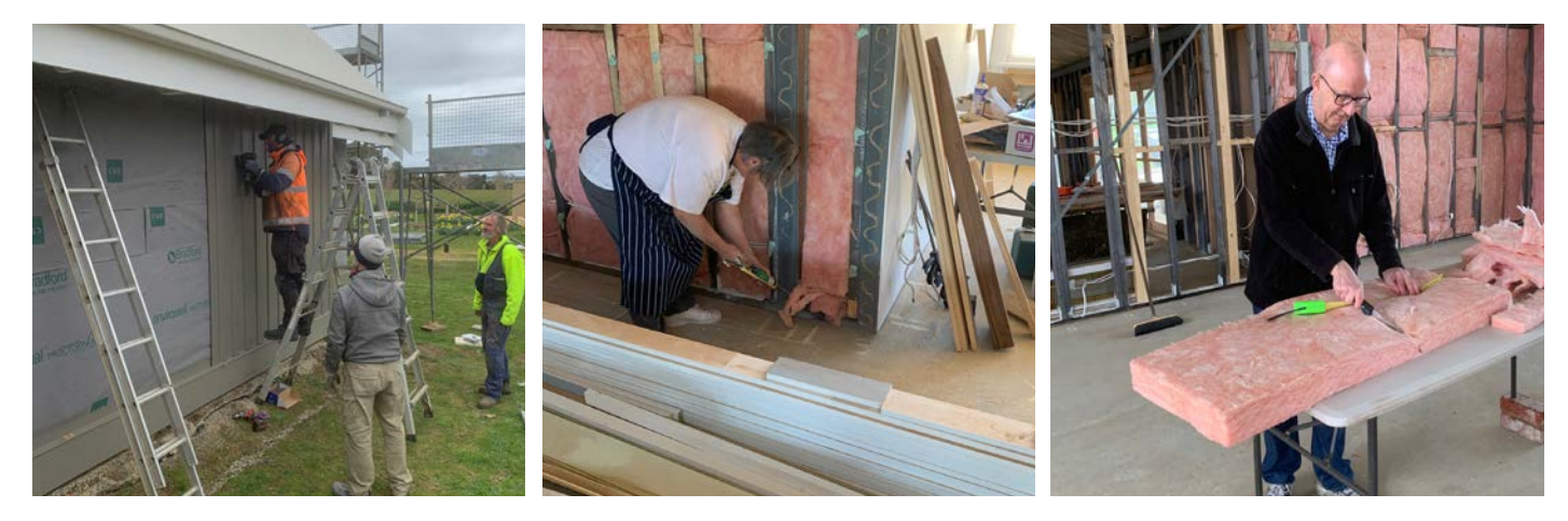
Together + Issue 6 + December 2023 + 15 + Click here to return to the contents

Together these teams worked with the members of the Community which instilled in them a great confidence and anticipation that the Community Centre would finally be completed. Friendships were deepened and the teams experienced the wonderful hospitality that the Community is known for - food, friendship, gifts, and encouragement. Overall, it was a great investment of teamwork showing that we truly are together on mission. And we give thanks to our God for His grace, joined with our effort, that together we move forward into the future