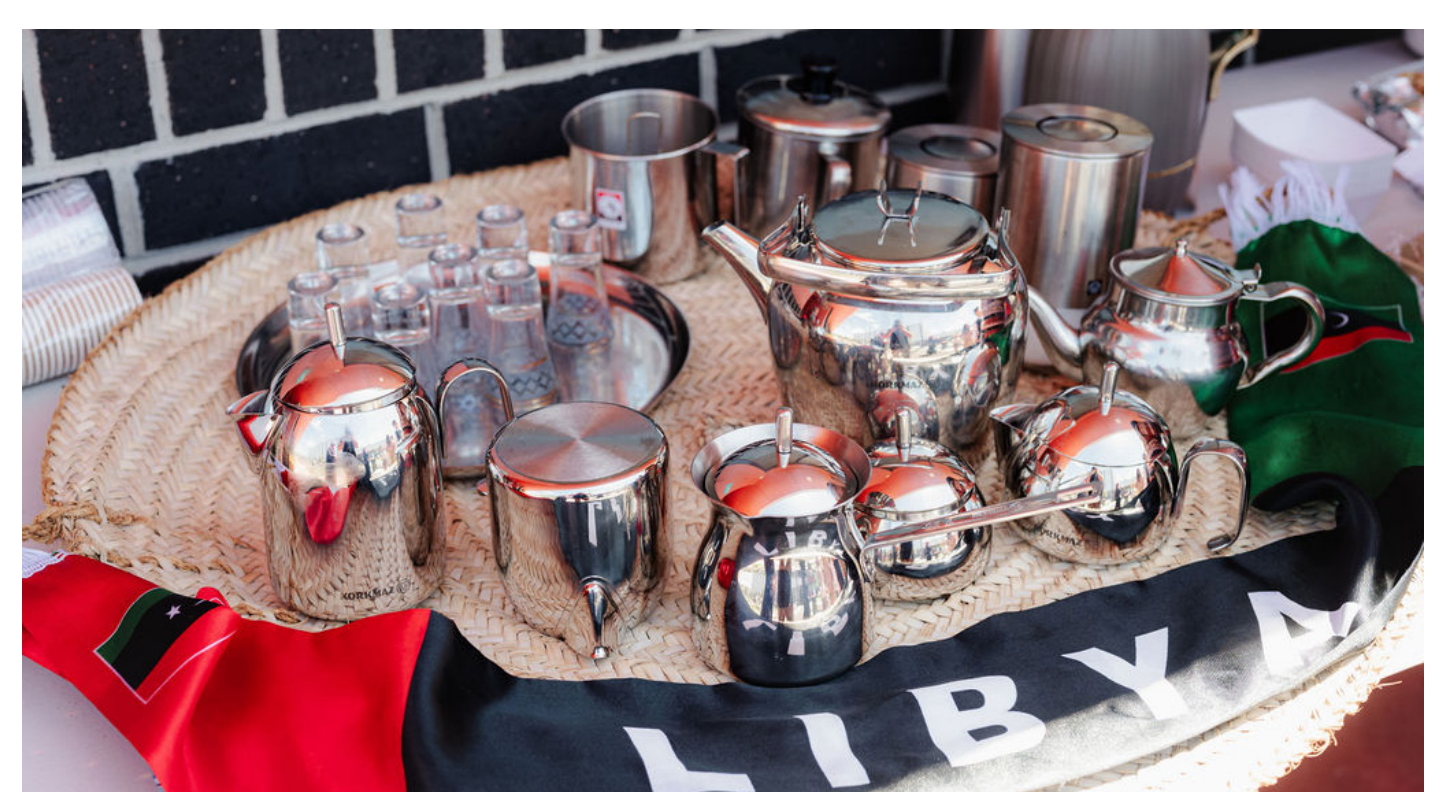
Together • Issue 7 • March 2024 • 8 • Click here to return to the contents

"We've got so many nations here on our doorstep in Donnybrook. It used to be that you had to travel to the other side of the world to share with people of other cultures, but now you just have to step outside your front door. With the Expo, our aim was to bring the community together, and to build friendships that will be lasting ones."