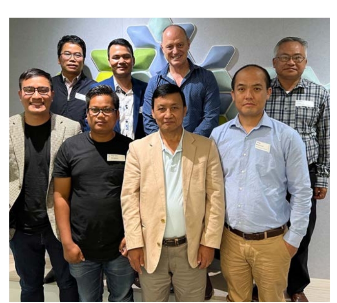
Chin Pastors - East