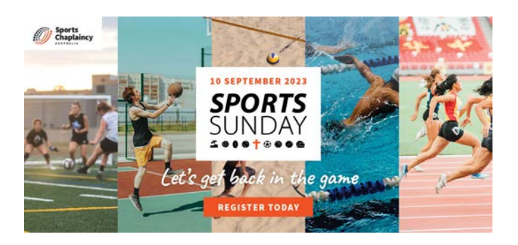
WHAT IS SPORTS SUNDAY?

On Sports Sunday, churches can use SCA information resources to include a brief segment about chaplaincy in their services. Register interest at <u>sportschaplaincy.</u> <u>com.au/Home/SportsSunday</u>