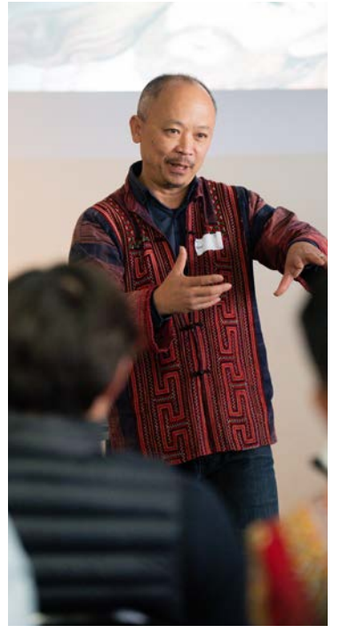
Together + Issue 5 + August 2023 + 11 + Click here to return to the contents